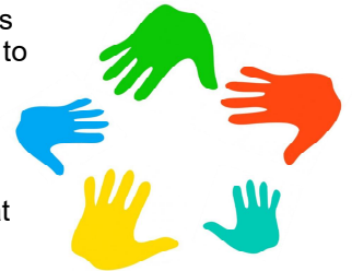
Parent Advisory Committee

All parents/guardians of students attending KBES are considered to be a PAC member. We have a very active and diligent PAC group who work to enhance your child’s learning opportunities and experiences at KBES.